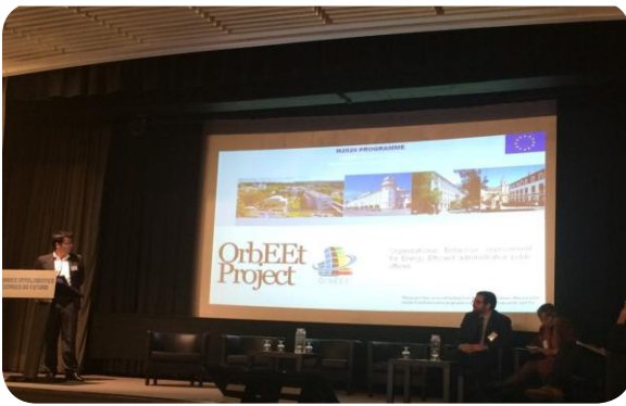
Third Conferencia “Cidades Inteligentes – Cidades do Futuro” Workshop

During the second semester of OrbEEt project implementations, its concept were presented at a congress and at a conferences. OrbEEt project was presented during the 4th European Congress on the use, management and conservation of buildings of historical value – born in the past, used today, preserved for the future (on the right). BHOE introduced OrbEEt project on the second day of the event where the subject was “Planning and implementing Appropriate Use and Representation of Historic Buildings – An Organizational Perspective”. The Third Conferencia “Cidades Inteligentes – Cidades do Futuro” was held in Lisboa, Portugal .Since the attendees were mainly belonging to PT experts, the focus was on the good practices towards the implementation of Horizon 2020 projects. The presentation was mainly focused on the dissemination of ORBEET concept and ideas while also the delivery of project timeplan, as an initial activity towards the dissemination of the project.