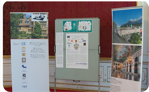
4th European Congress of BHOE